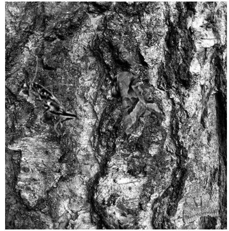
There are two moths and one cricket on this tree trunk. Can you find them?

Many plants and animals are hidden in plain site because their colors blend in with the area around them. In animals this is usually done for protection from prey. Plants can do this as a result of the kind of water they are getting or the amount of sun that hits them. Make a list of how this can help you learn about the area you are in.